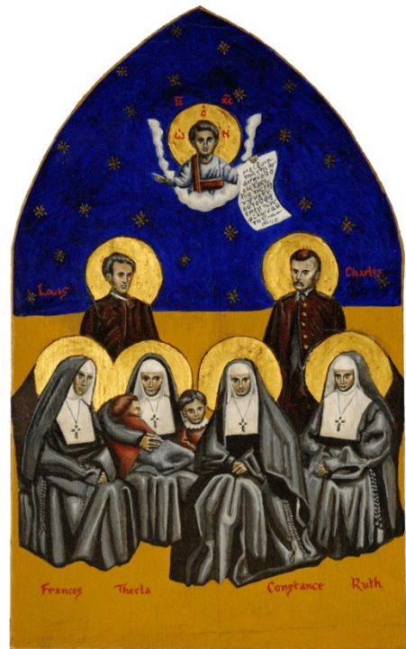
Icon of Constance and Her Companions, from St. Mary’s Episcopal Cathedral in Memphis, Diocese of West Tennessee.

This bulletin insert was adapted from A Great Cloud of Witnesses’ account of Constance and Her Companions.